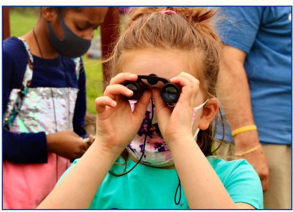
APRIL 28 - MAY 1, 2023