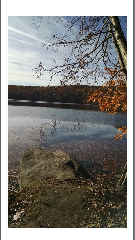
57A Old Bridge Road Brookfield, CT